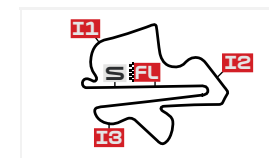
Petronas Sepang International 5543 m. Circuit

IT Ideal Lap Time, sum of the best partial times