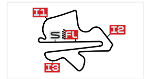
Petronas Sepang International 5543 m. Circuit