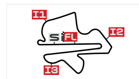
Petronas Sepang International 5543 m. Circuit