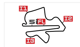
Petronas Sepang International 5543 m. Circuit