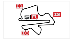
Petronas Sepang International 5543 m. Circuit