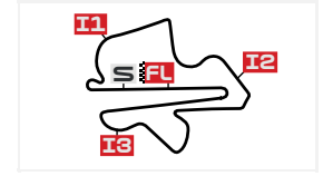
Petronas Sepang International 5543 m. Circuit