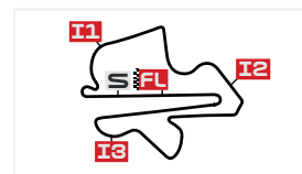
Petronas Sepang International 5543 m. Circuit